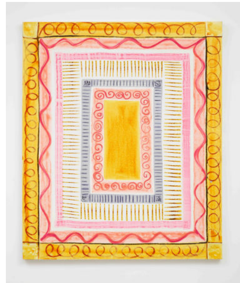
Tamara Gonzales, View Finder , 2023 acrylic and pastel on canvas 60 x 48 inches (152.40 x 121.92 cm)

Subway Directions: 1 train at Franklin Street, 4 5 6, J M, N R Q W, and A C E at Canal Street